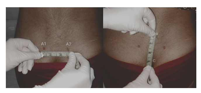
Figure 1: Height measurement

Mothers were measured for height while standing next to a wall with their feet and knees together, knees straight, heels, legs, hips, and shoulders parallel to the wall, hands hanging by their sides, and faces front. The mother's height was measured with the standiometer above her head (Figure 1).